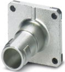
Flange housing, 25 mm x 25 mm

Please be informed that the data shown in this PDF Document is generated from our Online Catalog. Please find the complete data in the user's documentation. Our General Terms of Use for Downloads are valid ( http://download.phoenixcontact.com )